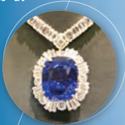
Below: Sapphire and diamond pendant – one of Christie's "Magnificent Jewels" at the private viewing they hosted for the Planned Giving Donor Reception.