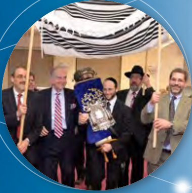
At the Torah Dedication celebratory event more than 80 people enjoyed refreshments, singing, and dancing.