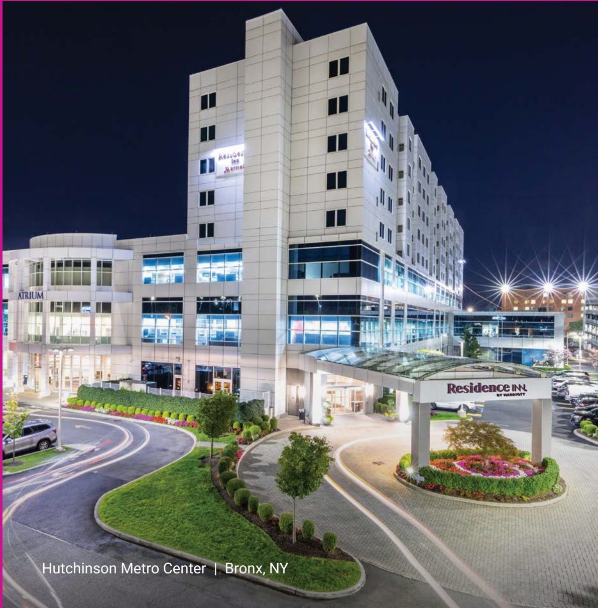
Hutchinson Metro Center | Bronx, NY